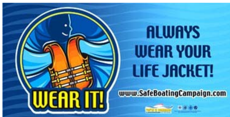
Photo credits: Our appreciation to Halkey-Roberts, CM Hammar/Mustang Survival, Stearns and Critter's Inflatable for permitting use of their photos.